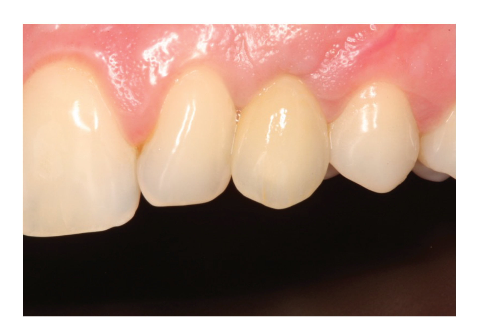
Figure 2. Zirconium-based crown.

Patients were recalled and inspected for presence of ceramic veneer fracture of any kind. The follow-up time was registered. Data was collected from specially developed electronic questionnaire.