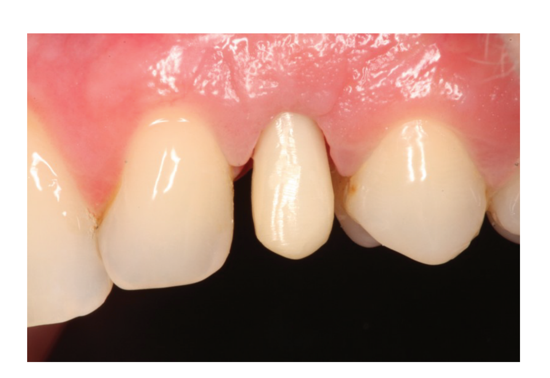
Figure 1. Framework of zirconium-based crown.

The aim of this study was to evaluate the veneer fracture rate of fixed zirconium-based restorations on implants delivered in private practice.